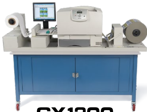
CX1200 COLOR LABEL PRESS