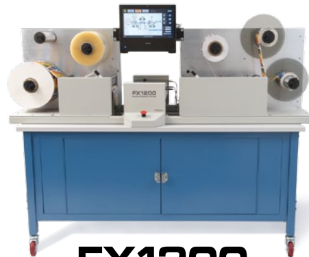
FX1200 DIGITAL FINISHING SYSTEM

There are lots of choices these days in the digital label press arena. It can all be very confusing. To help clear things up, we'd like to point out something that you may not know: Primera's CX1200 Digital Label Press and FX1200 Digital Label Finishing System are the best-selling mid-sized digital label production systems sold in the world today. Why? Because they're packed with features and benefits simply not available from others. They're also an exceptional value.